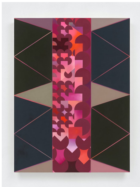
Marilyn Lerner, Science of Fiction , 2023, oil on wood panel, 32 x 34 inches

Each artist's work radiates palpable exuberance. Commonalities among them include precise lines and edges and a bold color sense. There are also stark differences. Daniels' crisp curvilinear bursts of orange, red, blue, and green on white surfaces, alone or in pairs, are borderline psychedelic. They're like stills of strobe lights pulsing outward – articulated, stylized splats in blazing hues or pared-down, monochromatic Lichtensteinian explosions. Titled descriptively for the colors in each painting (e.g., Orange-Yellow with White ), their impact stems from their flat expanses of color and in-your-face presentation.