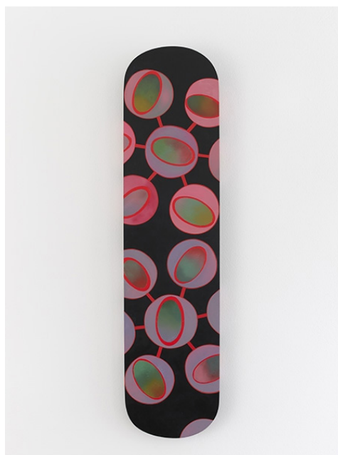
Marilyn Lerner, Butterfly Dreams , 2021, oil on wood panel, 34 x 8 inches